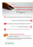
Health Insurance Coverage