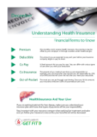
Financial Terms to Know