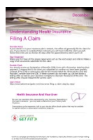
Filing an Insurance Claim