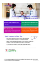
Types of Health Insurance