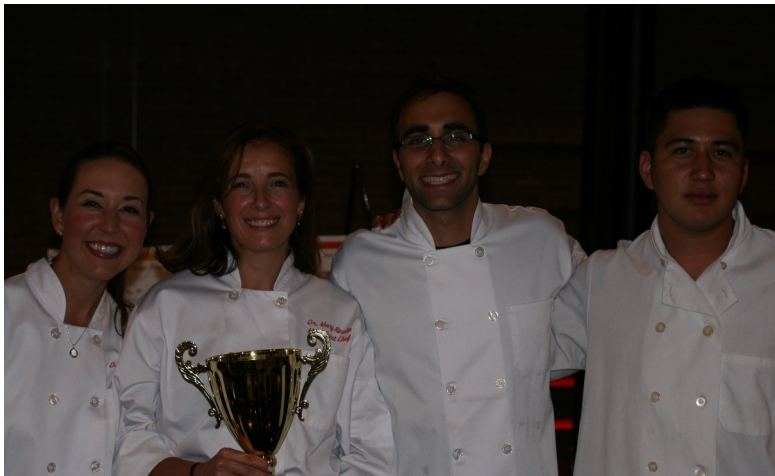
2016 "Top Chef" Chefs