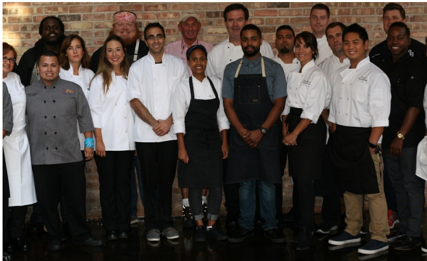
2016 Flavors Chefs